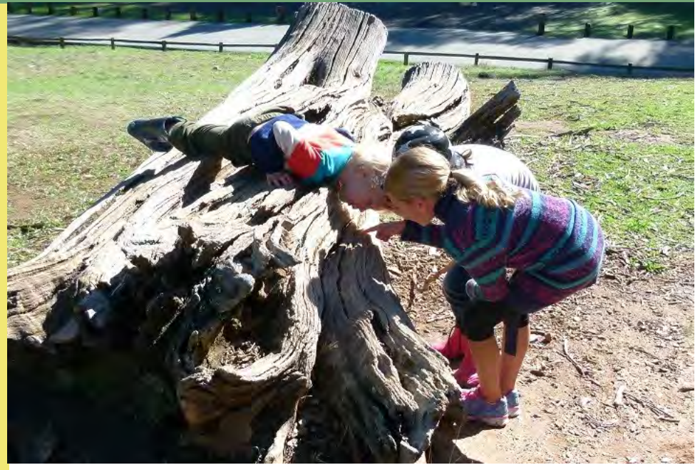
Huddart Park Nature Hikes