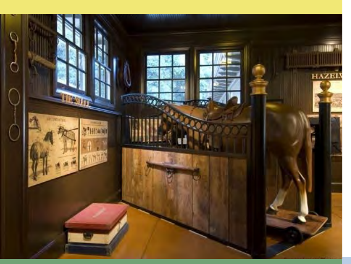
Folger School Program